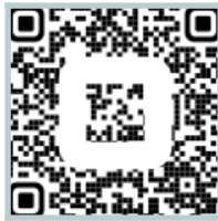
$75.00 Individual Ticket