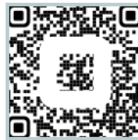
$150.00 for a Pair of Tickets