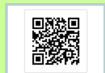
Cookies and Crafts