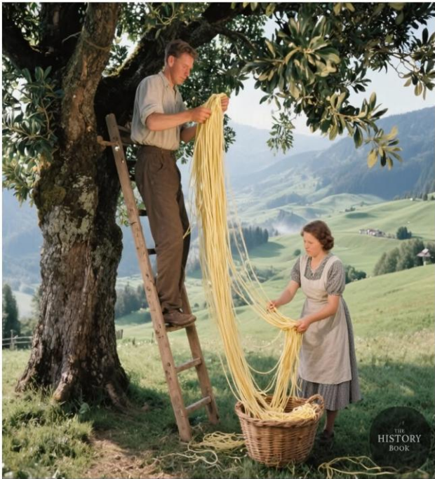
BBC news once convinced thousands of viewers spaghetti grew on trees. A 1957 April Fools' prank showed farmers harvesting pasta. When viewers asked how to grow their own, the BBC told them to plant a sprig in tomato sauce.