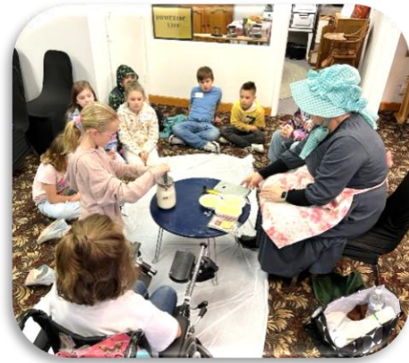
Making home churned butter and having a taste!

On March 24 and 25 about 150 third graders, teachers and chaperones from Navigator School came to the museum in groups, each lasting an hour and a half. During that time, they visited a 19 th century schoolroom, made butter, made an old-fashioned decorative craft and toured the gallery.